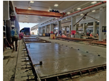
Insulated wall panels being quality controlled manufactured on long line beds.