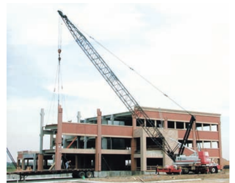
Precast panels being delivered just in time to the site.