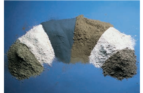
SCM'S reduce the embodied energy of precast concrete products by substituting waste materials for cement.

The availability of 3rd party verification - based on life cycle assessments (LCA) – provide re-assurance about the accuracy and comparability of environmental product data.